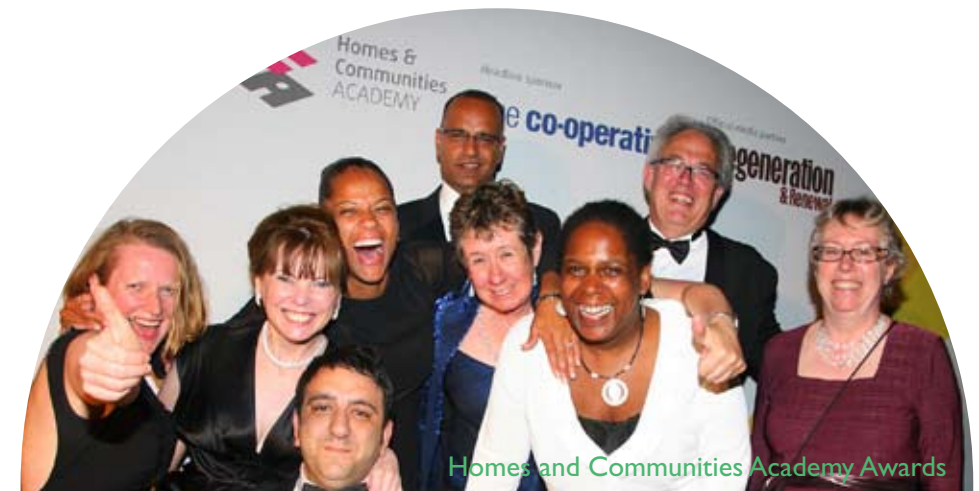
Homes and Communities Academy Awards